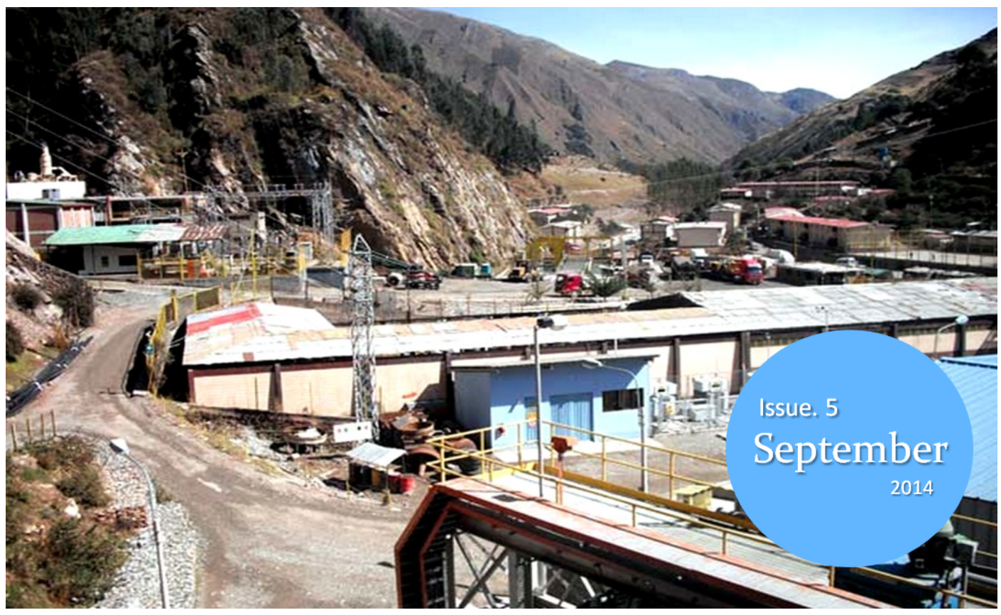
A pilot programme was started in Peru to eliminate PCBs from equipment in the mining industry, using dechlorination.